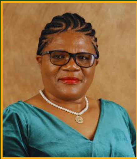
HON MAYOR, Cllr Nomhle Sango